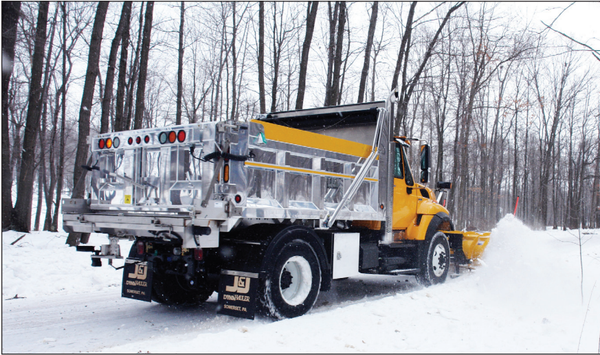
J&J medium-duty dump bodies are built to work in extreme conditions all year round.