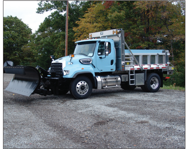
Let J&J put together a dump body package that suits your application.