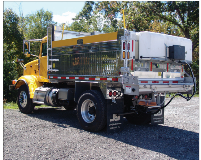
Polished aluminum smooth side (EVO) bodies are also available.

For a complete list of options, call J&J today!