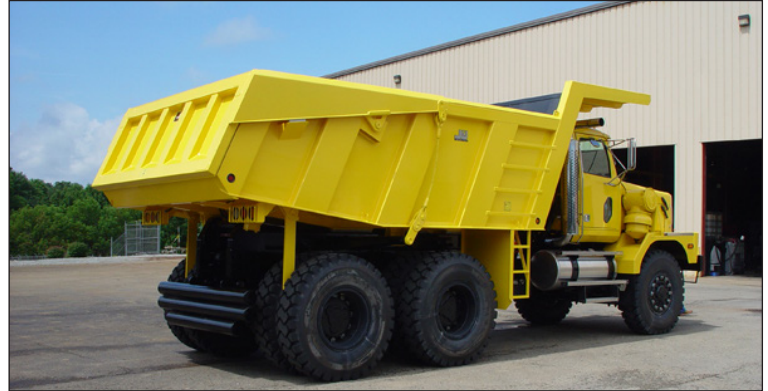
The low profile sides are designed for easy and efficient loading with a scowled end to secure large boulders and reduce hydraulic cylinder stress upon boulder impact.

For a complete list of options, call J&J today!