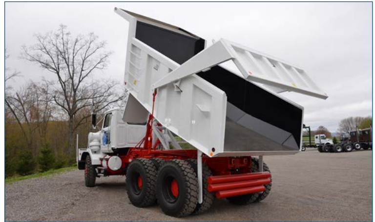
The auto lift tailgate maximizes material loading while the full cab guard protects the operators in the cab from falling debris.