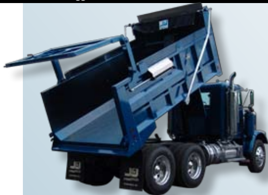
This steel Lightweight Crossmemberless (LWC) is used to haul large rocks and boulders.

For Parts, call 814.444.3470 or 800.777.2671.