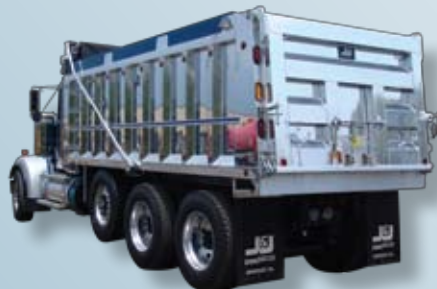
Our popular aluminum Material Hauler (MH) is an ideal solution for hauling sand, aggregate, and asphalt.