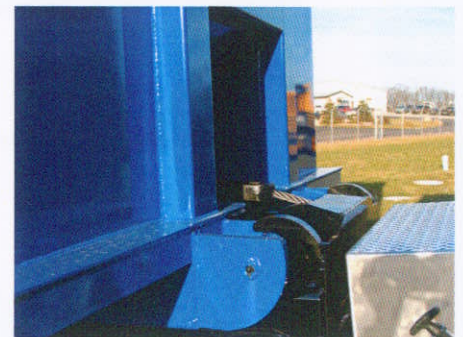
Heavy-duty, replaceable tail rollers, inside and outside controls for easy access and heavy-duty stops are standard features on J&J roll-off trucks.